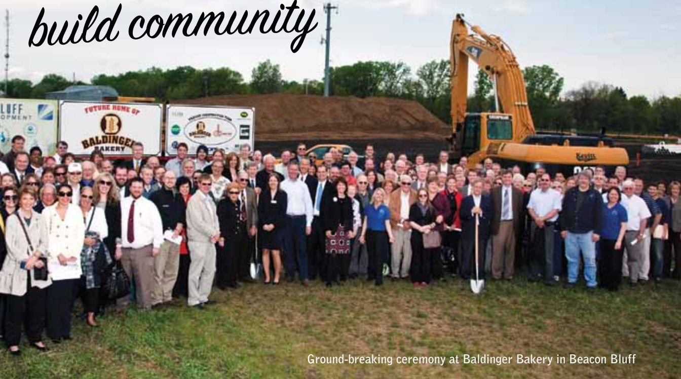
Ground-breaking ceremony at Baldinger Bakery in Beacon Bluff

Port Authority construction projects employed 924 people throughout Saint Paul in 2010.