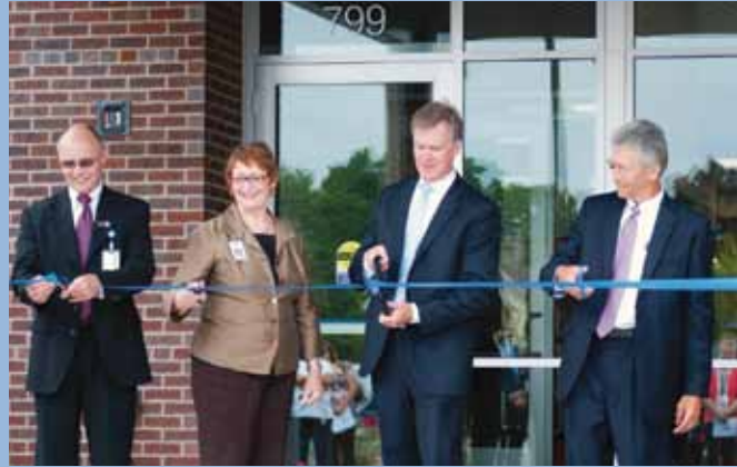
HealthEast Medical Transportation Ribbon Cutting

W e have the unique transactional expertise to help your organization expand in Saint Paul by offering clean building sites and specialized expansion financing.