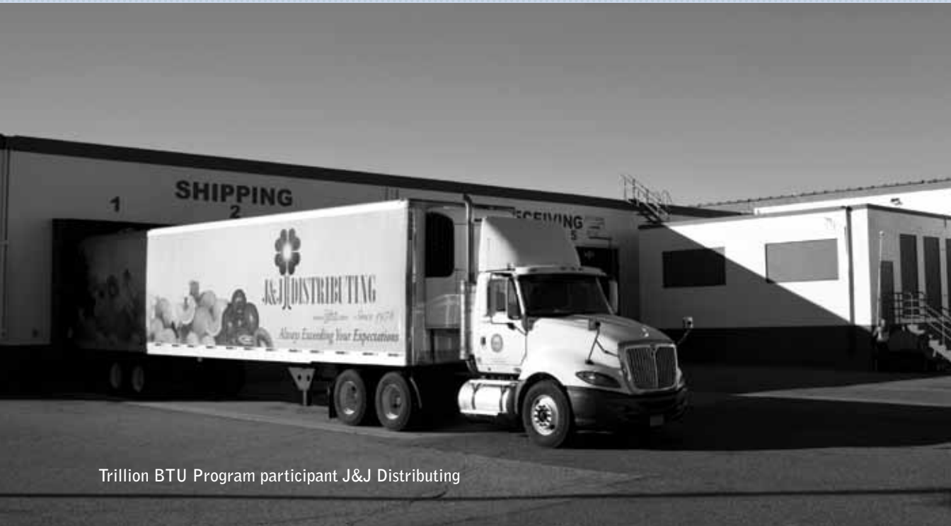
Trillion BTU Program participant J&J Distributing

Capital City Partnership, City of Saint Paul, Economic Development Association of Minnesota, Fresh Energy, Great River Greening, Hmong American Partnership, Lao Family Services Council, Midway Chamber of Commerce, Minnesota Agri-Growth Council, Minnesota Brownfields, Minnesota Department of Commerce, Minnesota Department of Employment and Economic Development, Minnesota Environmental Initiative, Minnesota Hmong Chamber of Commerce, Minnesota Legislature, Minnesota Pollution Control Agency, Minnesota Ports Association, Minnesota's U.S. Congressional Delegation, Neighborhood Development Center, Ramsey County, River Resource Alliance, Saint Paul Area Chamber of Commerce, Saint Paul District Councils, Saint Paul Riverfront Corporation, 1,000 Friends of Minnesota, Upper Mississippi Waterways Association, U.S. Economic Development Administration, U.S. Environmental Protection Agency