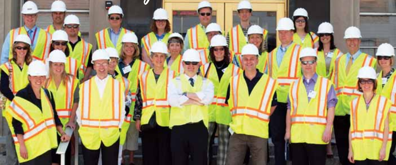
Economic Development Association of Minnesota tour of Beacon Bluff